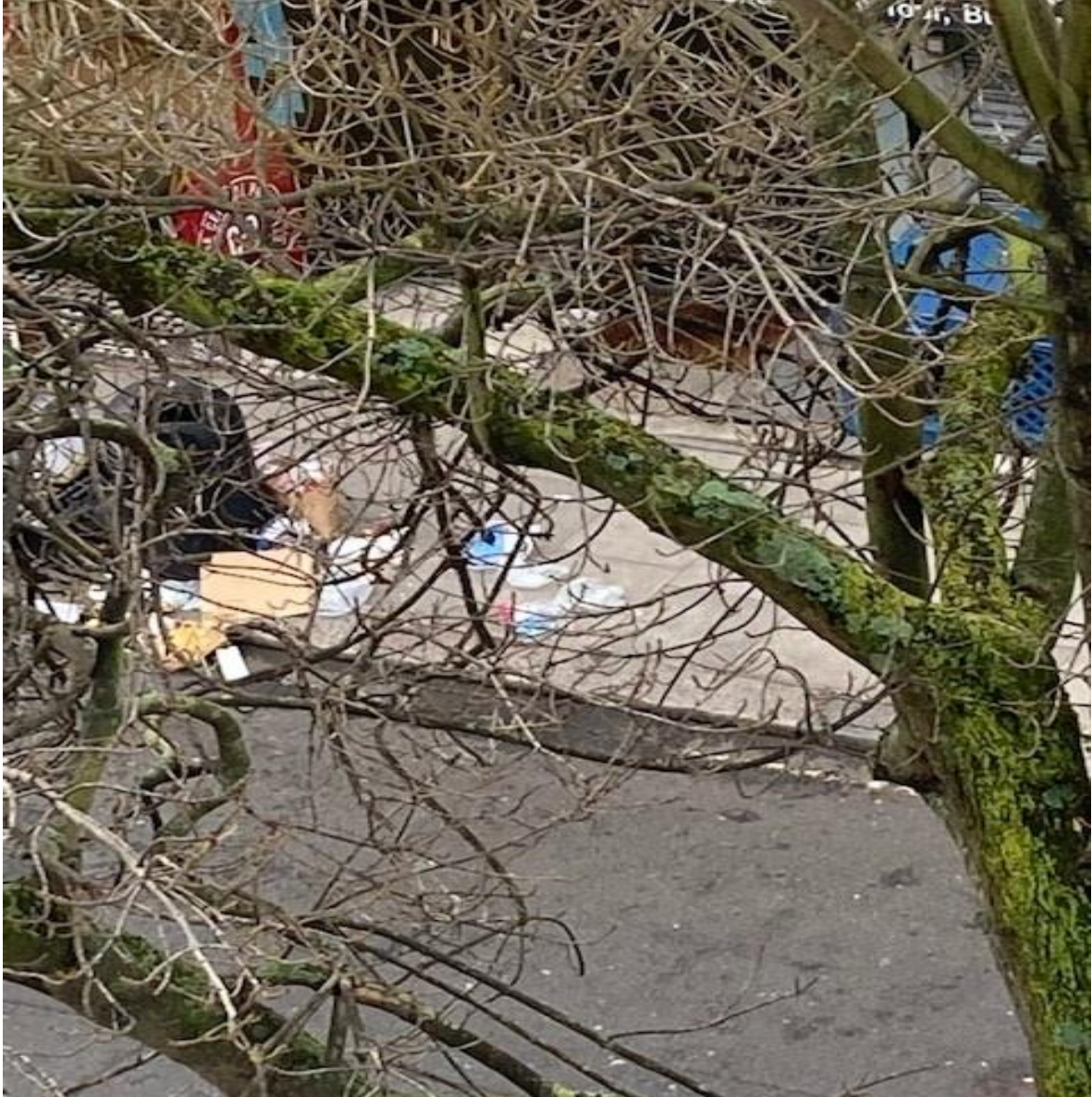
On 22 nd February 2022 Mr Vance confirmed location of photo was taken of premises from other side of the road.